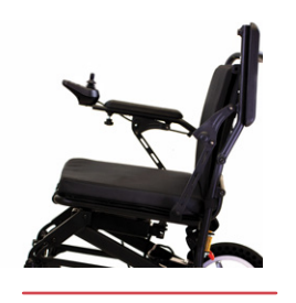
Flip up arm rests for a barrier-free side entry