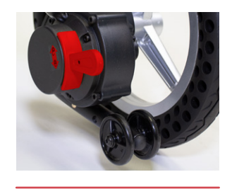
When powered off, freewheel (push) mode can be utilized and the wheels turn freely